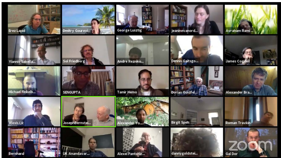
Figure 1: Bernstein 75, May 13, 2020, The Weizmann Institute, Rehovot