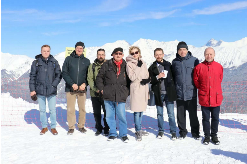
Figure 1: Workshop "Automorphic forms and integrable systems" February 26, 2020, Sochi, Russia https://trv-science.ru/2020/04/sirius/